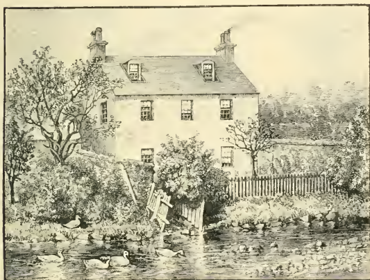
House at Peebles in which WILLIAM and ROBERT CHAMBERS were born